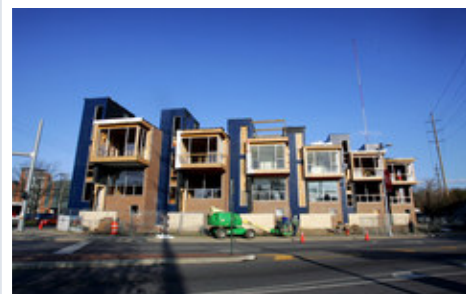
View full size

Other developments are springing up around the university and the improved public transit line. Allegro Realty Advisors purchased the nearby Morse Graphic Arts building and is renovating the property for its new offices plus ground-floor eateries or stores. Allegro, based in Independence, plans to move its 11 employees downtown in the spring.